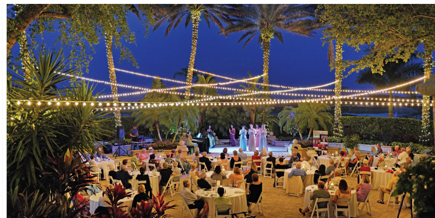
Divas & Dinner, Club at the Strand, April 2021

Gulfshore Opera engages each of the communities it serves through fun and friendly social events and community concerts. These are held in private clubs, unique venues - some outdoor, and well-known venues in the communities that we serve. They are presented by versatile professional artists, performing favorite works from Opera to Broadway and popular songs of the 60's and 70's. Events often include a cocktail hour, lovely meal and plenty of time to mix and mingle.