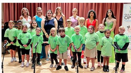
GO Spring Celebration Concert GO Divas, Talented Teen & Harmony Choir Gulf Theater, May 2021