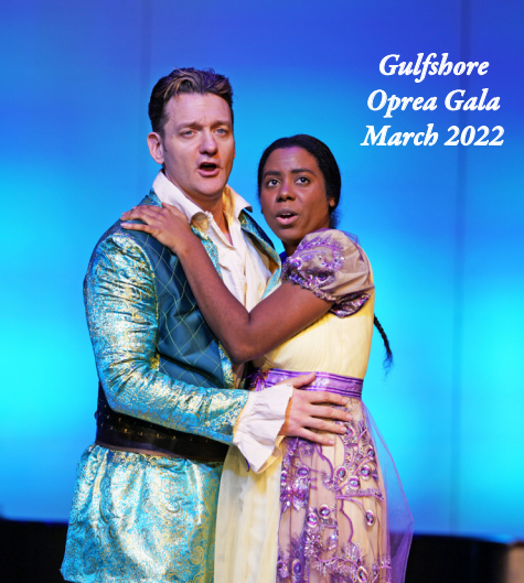
Gulfshore Oprea Gala March 2022