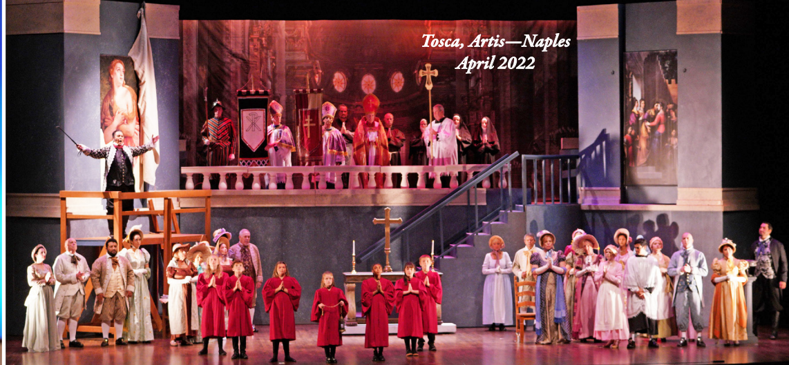
Tosca, Artis—Naples April 2022