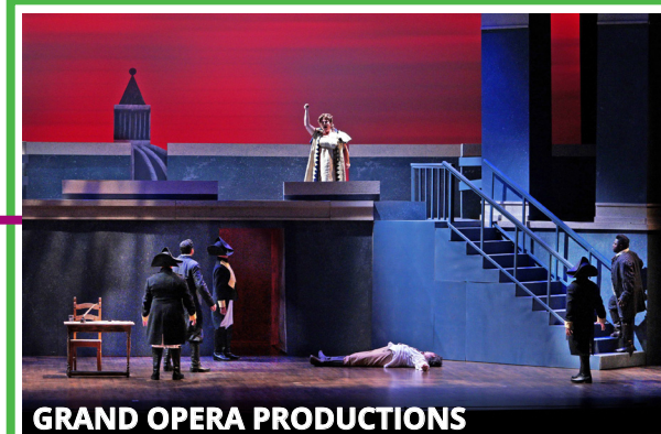
GRAND OPERA PRODUCTIONS

GULF SHORE OPERA YOUR REGIONAL OPERA COMPANY CHARLOTTE • LEE • COLLIER