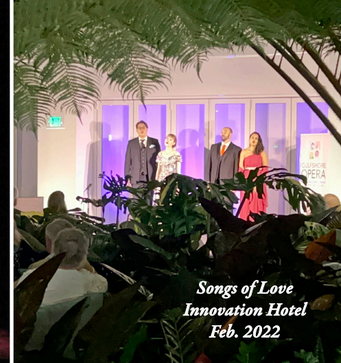
Songs of Love Innovation Hotel Feb. 2022